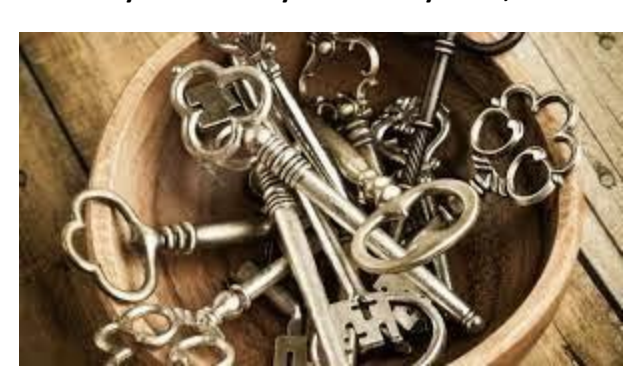
August 27, 2023

First Reading – Isaiah 22. 15, 19-23. I will place on his shoulders the key of the House of David